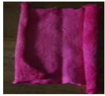
Normal cotton dyed fabric