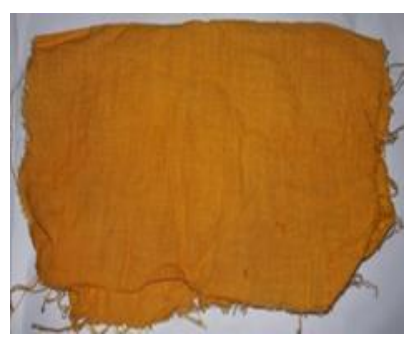
Normal dyed cotton

The silk fabric had a moderate wash fastness which was tested by attaching the multi fabric on it by applying the same process and procedure (Fig. 4).