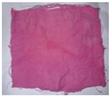
Dyed cotton by Reactive dye