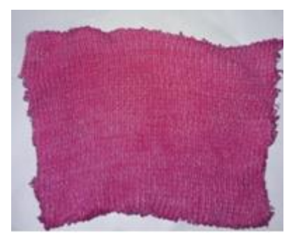
Normal reactive dyed cotton