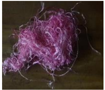
Hydrolyzed reactive dyed nylon yarn after soaping

Figure 3 Treated and untreated dye sample of silk and nylon yarn