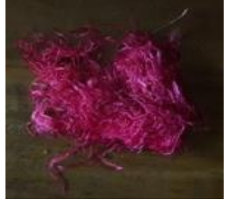
Hydrolyzed reactive dyed nylon yarn