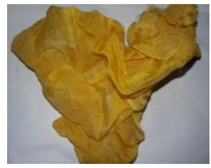
Dyed silk fabric by using left dye bath