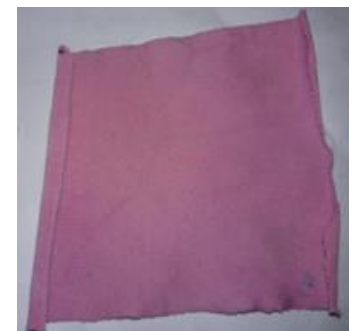
Hydrolyzed dyed Nylon