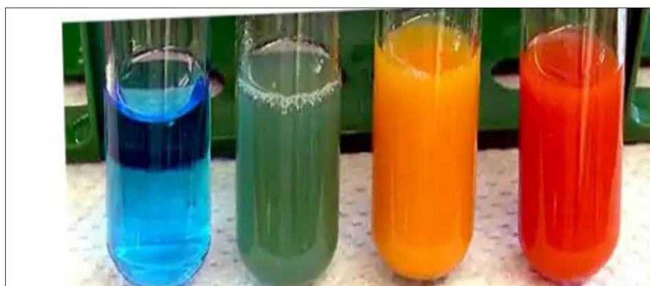
Figure 1 Colour Change based on percentage of sugar present

Based on the test for simple sugar using Benedict solution: it shows that the amount of sugar recovered in the pretreatment is far higher when compared with the non-pretreated biomass.